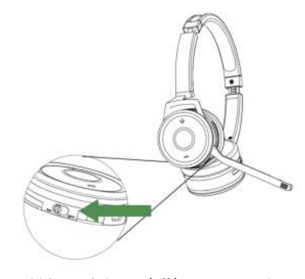
Hold (2 secs) the On/off/connect switch in the connecting position