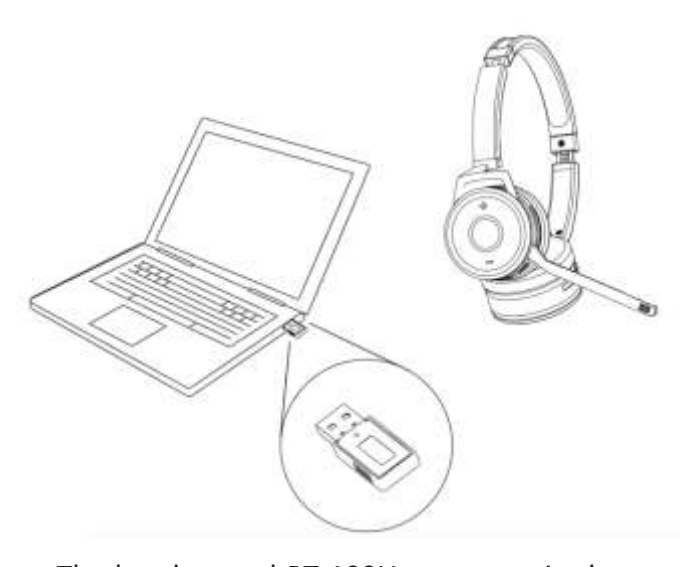
The headset and BT 100U are pre-paired and ready for use